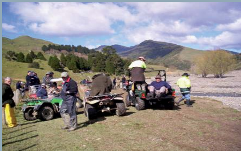
Mataraoa Station, August 2006, Heading up the back!

The project will finish in June 2008. The four stations have been actively working on their development plans, improving their land, their stock numbers and their overall economic performance. Their experiences will provide confidence to the wider community and the links that have been formed will continue after the life of the project, providing benefits to the Tairāwhiti region.